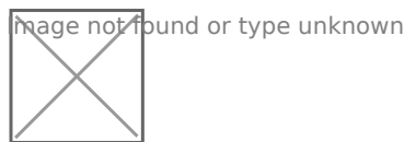
Figure 1 - Smart grid with new technologies in the power transmission system

Stanford's network architecture and control scheme simultaneously optimizes energy arbitrage and reduces energy cost by distributing control between a global controller (GC) and local controllers (LCs), shifting more responsibility for control decisions to the local controllers. This provides a win-win relationship between the utility companies, who may provide the global coordination, and the DER providers who may provide the local control.